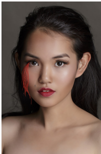
MAKE UP : Hien Nguy