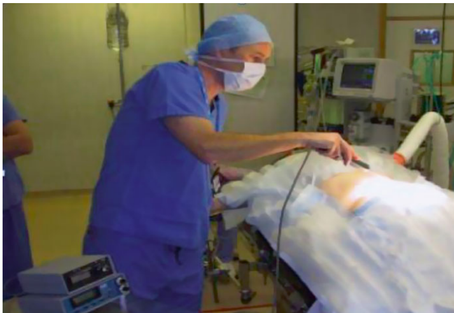
Fig. 13.2 The author using an early gamma probe in the operating theatre in the 1980s

serum albumin [10] a spin off from the Bass brewing industry and recombinant branched-chain polypeptide synthetics [11] and aptamers [12]. Perhaps more unique to Nottingham was the use of nuclear medicine techniques in the study of conventional drug delivery and formulation. Extensive studies were undertaken to image the release, delivery and biodistribution of formulations including enteric coated oral dose forms, enemas, eye drops, nasal sprays and aerosols [13–15]. Much of this work has involved the study of tablet swallowing [16], gastrointestinal transit, the understanding of gastrointestinal physiology and the development of nuclear medicine imaging techniques for the study of the gastrointestinal tract Fig. 13.3 [17].